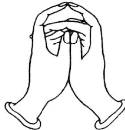
Illustration of mudra:

Akasagarbha Mudra: The fingers of both hands are interlaced outwards. Place both index fingers upright with the tips touching each other to form an arc. The thumbs are then placed side by side against each other.