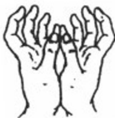
Illustration of mudra:

Mudra: Lotus Mudra/Pearl-holding Mudra, form both hands as an open lotus holding a precious pearl.