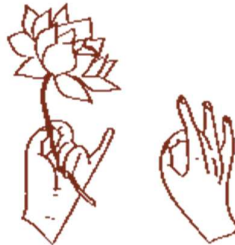
Illustration of mudra:

Place the left hand before the left side of the chest, with the palm facing inward and fingers together, pointed up. Now bend the thumb and index finger so that their tips meet, forming a circle. Then bend the middle and ring finger in to touch the center of the palm. The small finger remains pointed up. (This is the Lotus-holding Mudra.)