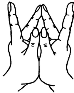
Illustration of mudra:

Earth Mother Bodhisattva Mudra: Interlace the fingers of both hands inwards. Place the middle fingers upright and touching. Straighten the index fingers and point them apart. Straighten the thumbs and place them side by side while touching the thumbs lightly against the middle fingers. Hold the mudra in front of your chest.